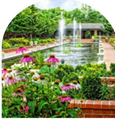
FLORIDA BOTANICAL GARDEN