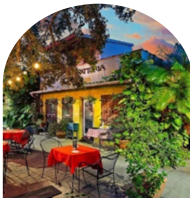
PIA'S TRATTORIA AUTHENTIC ITALIAN