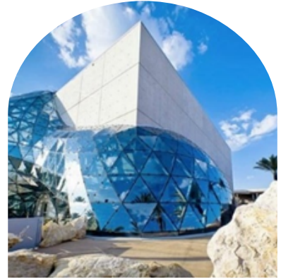
THE DALI MUSEUM