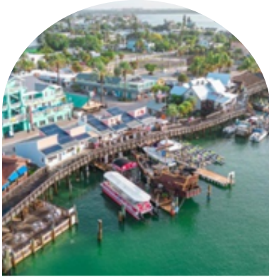
JOHN'S PASS VILLAGE & BOARDWALK